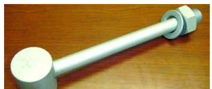
• Blade bolts M+65