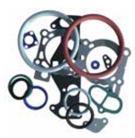
Oil, Lubrication, Filters and cooling liquids