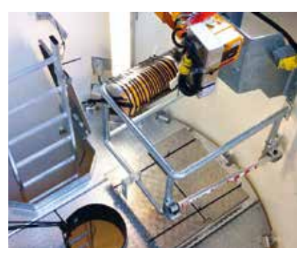
· Hoist · Elevator · Climb assist