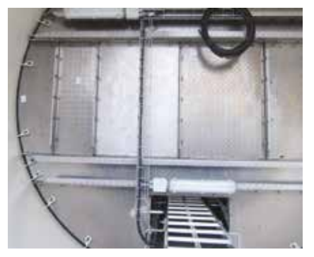
• Platforms in aluminum, steel & wood